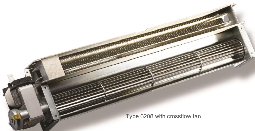
Type 6208 with crossflow fan