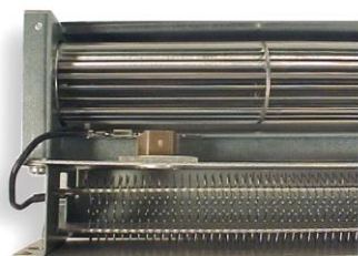
fan unit with heating element